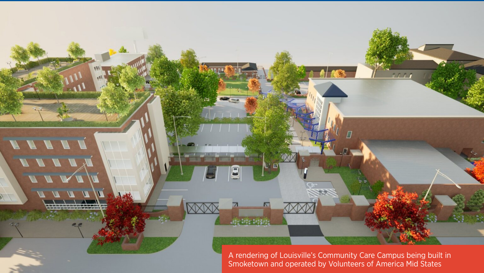
A rendering of Louisville's Community Care Campus being built in Smoketown and operated by Volunteers of America Mid States